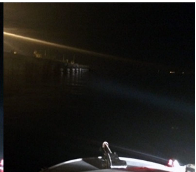
Competition LED spotlight beam