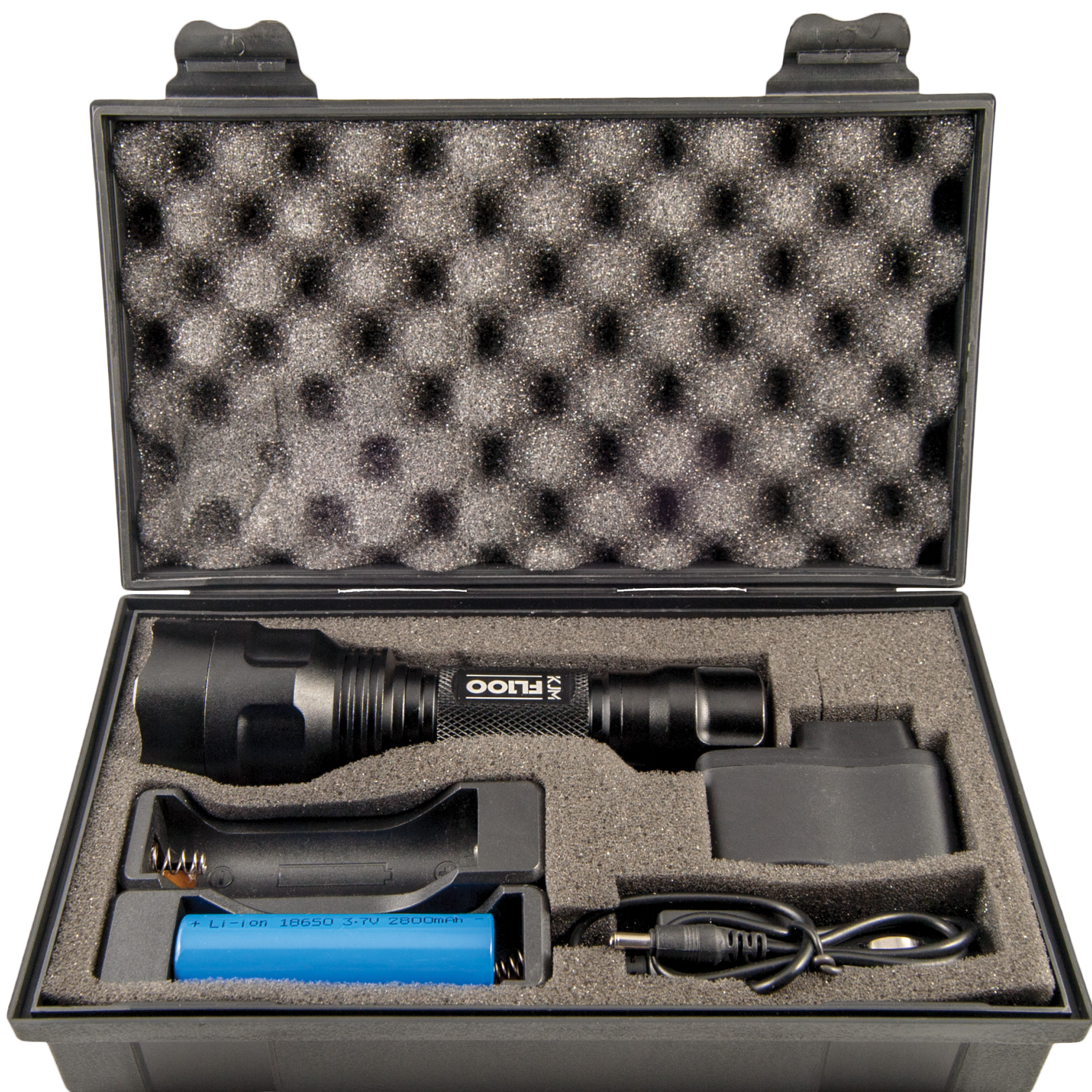
FL100 Hard-case Package