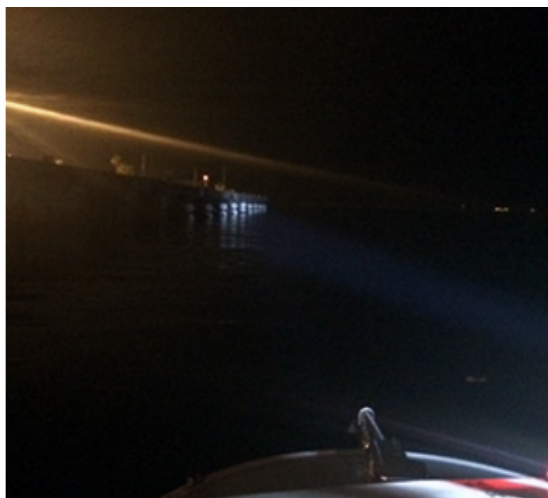
KJM SL100 LED spotlight beam